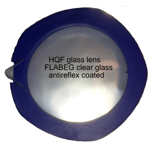
ocular ring in rubber material, perfect fitting

The soft polyethylene foil is easy to handle and protects the Microscope in the sterile surgical field. The high-quality lens cover reduces reflections and diffuse blurring. The lens produces a bright view and clear focus of the surgical field. It's as clear as daylight!